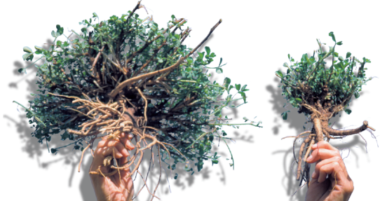
Traffic Tested® Conventional

Traffic Tested® plants have 30 percent larger roots that store up to 70 percent more energy, promoting higher yields over the life of the stand.